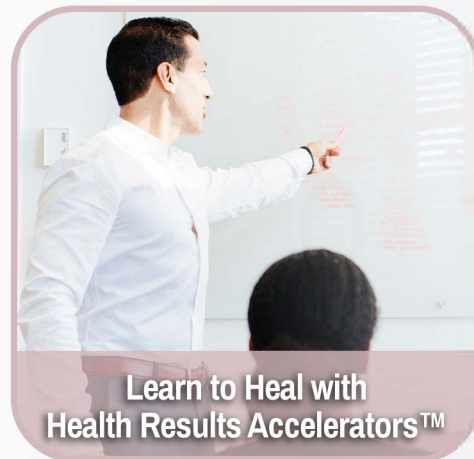
Learn to Heal with Health Results Accelerators™