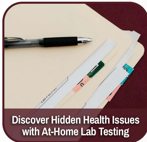
Discover Hidden Health Issues with At-Home Lab Testing