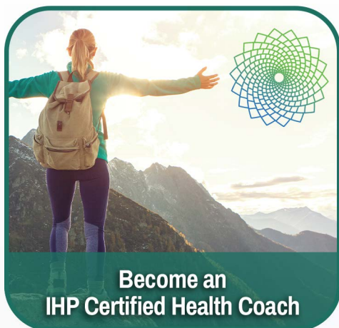
Become an IHP Certified Health Coach